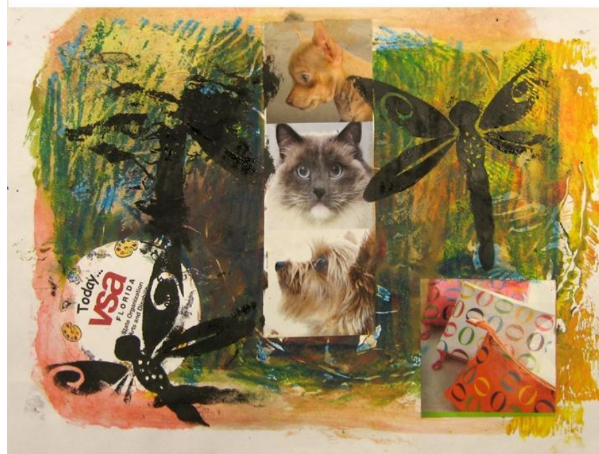
Art work from an ArtThread residency program in Polk County.

A twist to our time honored VSA Florida Artist in Residency Program in Florida public schools united three organizations in one singular mission - bring opportunities for creative expression to students with Disabilities using computer technology. The collaboration brought together VSA Florida, Project Ten: Transition Education Network; and the ArtThread Foundation's "Work of Art" program. Twelve VSA Florida teaching artists were placed around the state in art residency programs using the skills they gained from a "Work of Art" training session presented by ArtThread faculty this summer in Orlando. This training and residency project was funded by Project 10. The students' work can be seen by visiting the Project 10/ArtThread Gallery at Project10.ArtThread.org .